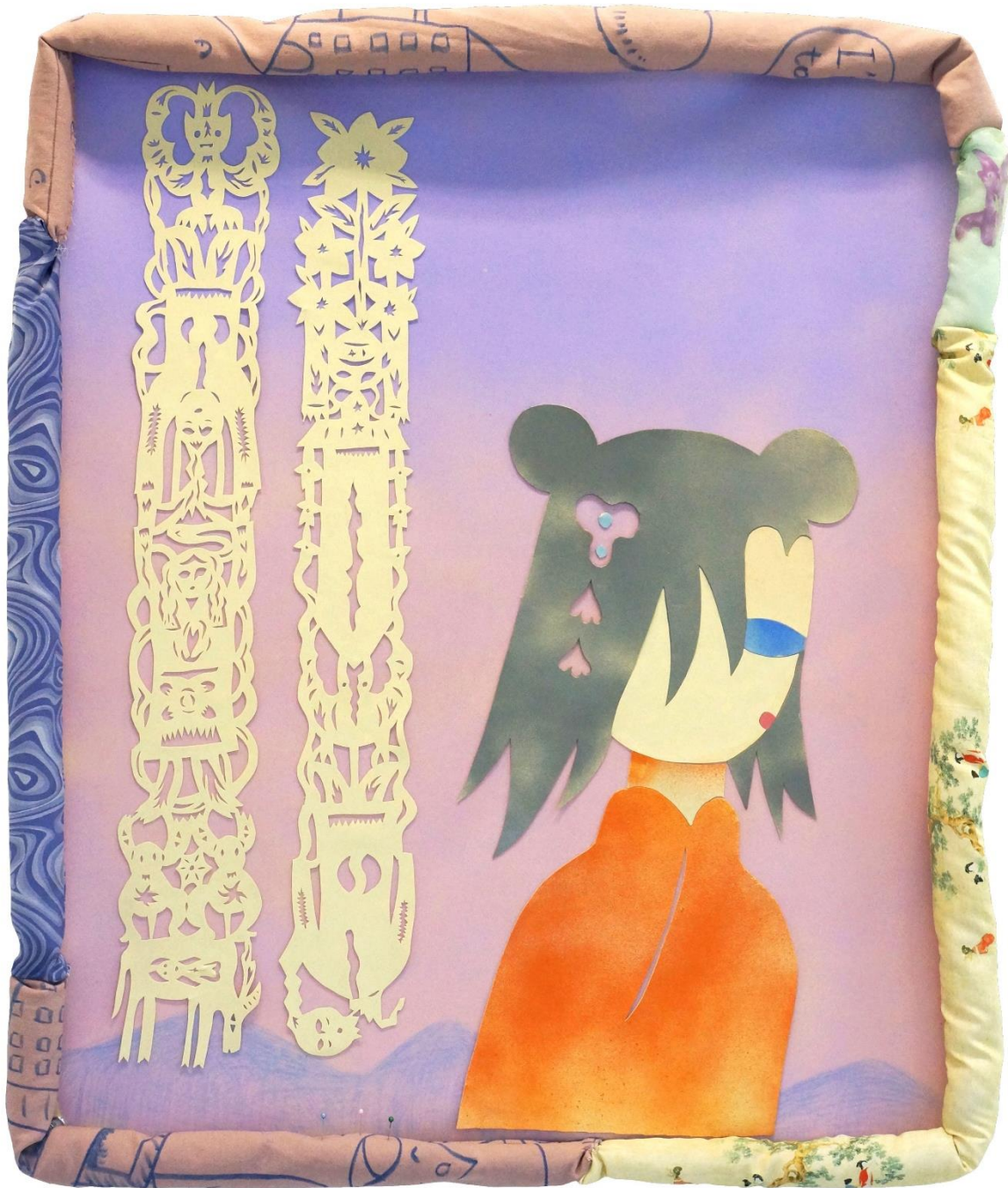
Castle in the Air by Mengwei Chen