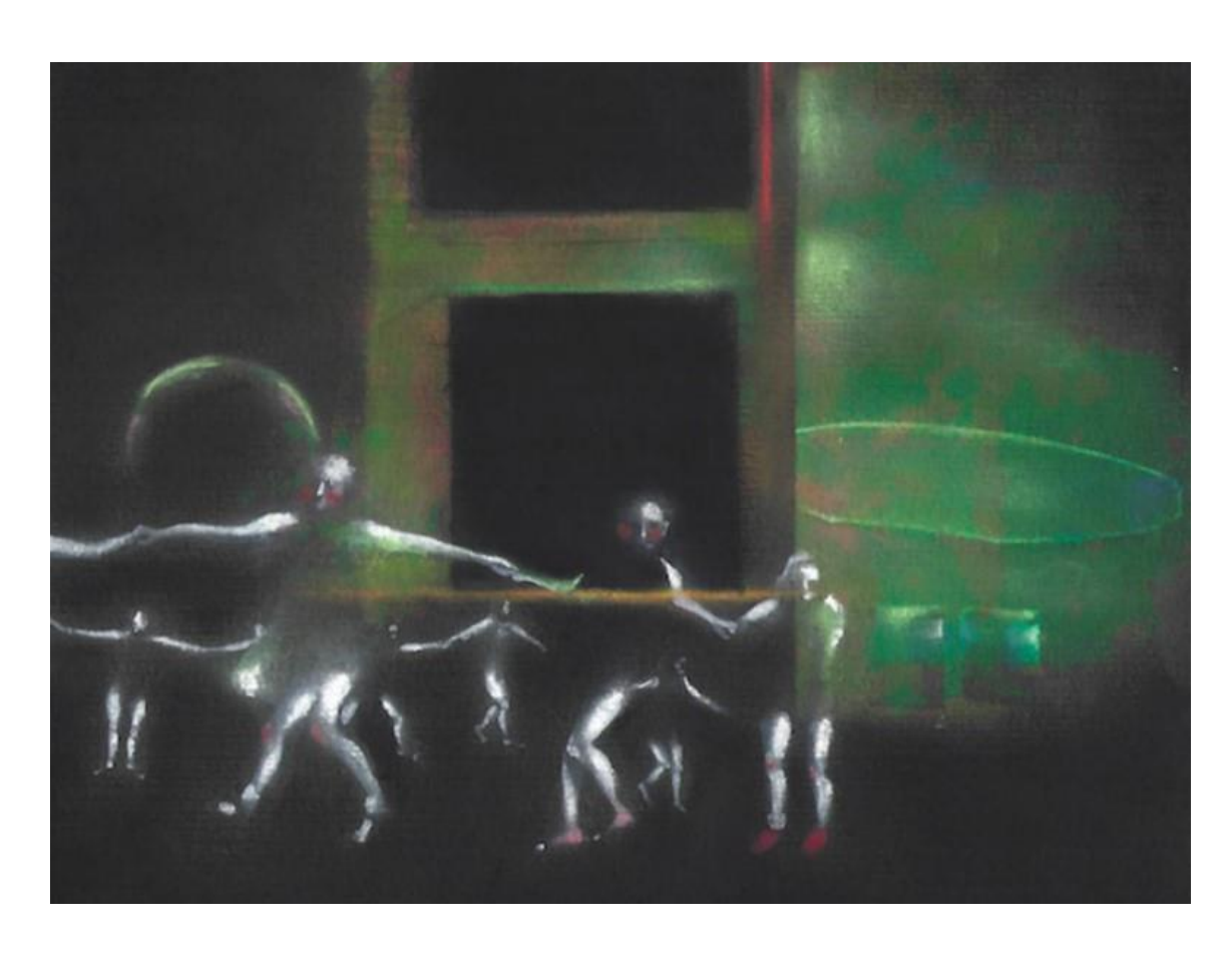
Untitled by Imogen Browning