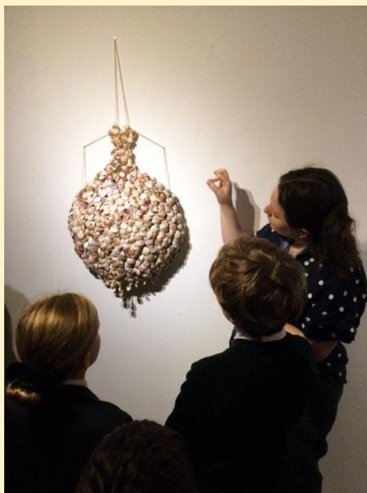
A gallery tour of the exhibition Soft Façade (2022) by a member of staff.