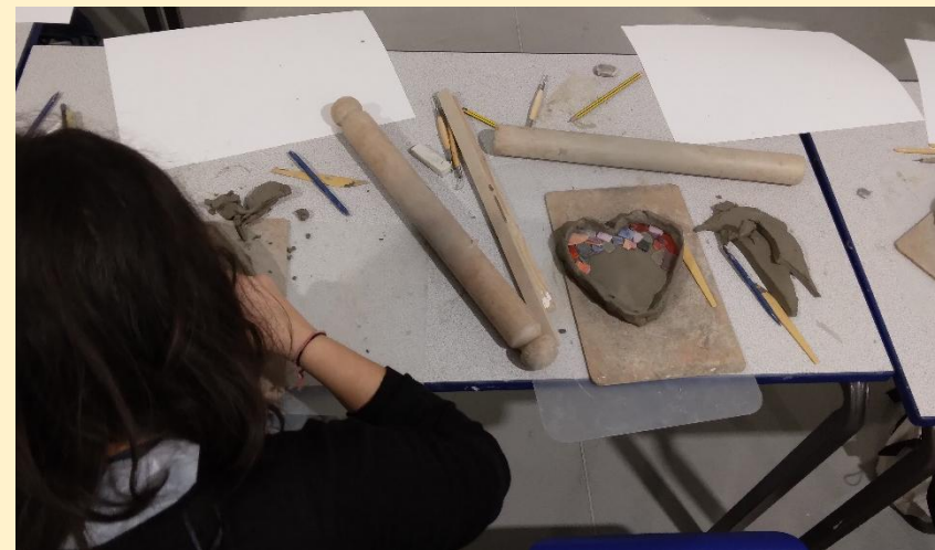
A mixed-media plaster casting workshop.