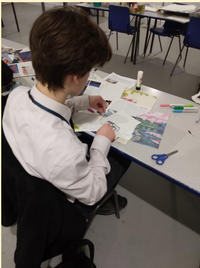
Expanded collage workshop.